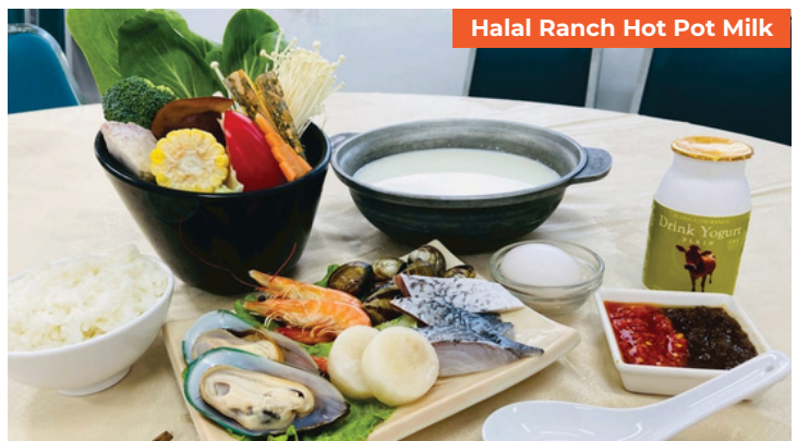
Halal Ranch Hot Pot Milk