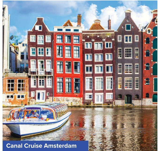
Canal Cruise Amsterdam