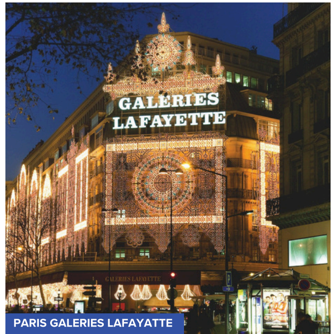
PARIS GALERIES LAFAYETTE